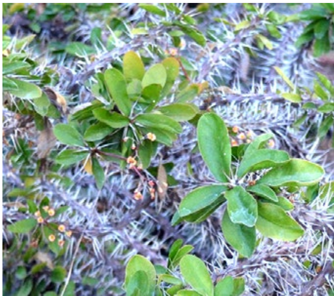
Euphorbia millii at HBG