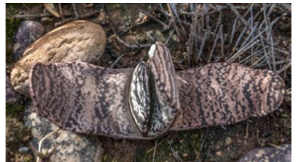
From the top: Gasteria pillansii var ernesti-ruschii