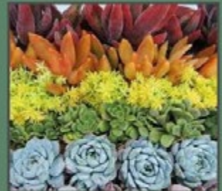
Steve Super Gardens