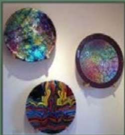
Rod Baker Art Glass

Art • Gifts • Stocking Stuffers • Home-Garden Décor