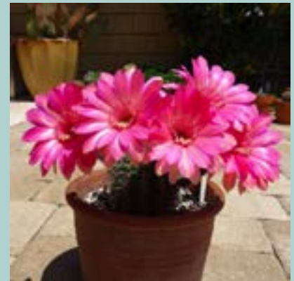
5" diameter flowers overwhelm a 4" diameter "Antares" hybrid