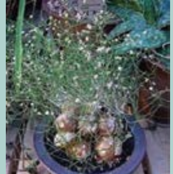
Schizobasis intricata (Drimia)