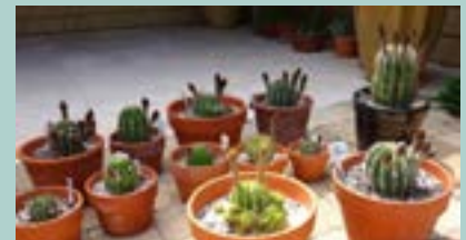
Different varieties approaching second bloom in May