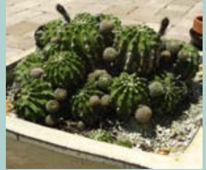
Numerous "pups" on this large cluster of Anastasia hybrid.

When should I repot my Echinopsis ? Repotting Echinopsis every spring provides fresh soil to boost flower and overall plant growth. Or repot every 2nd or 3rd year, but blooming may be reduced. Repotting each year enables examination of the root structure grown over the past year. Echinopsis do not like being root bound; they need sufficient room for new growth.