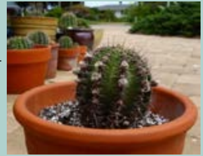
Echinopsis cacti displaying the typical sea urchin shape. Each "cotton" puff on the "Aquila" hybrid is the beginning of a flower.

What is the optimal soil mix? Don't plant Echinopsis in regular potting mix. It retains too much water for too long. Make an Echinopsis mix by combining 25% perlite, 25% sand with 50% soil. Choose gritty builders' sand over finer playground sand. After planting Echinopsis , sprinkle extra sand around the base of the plant. Echinopsis experts say this sand provides extra abrasiveness helpful to creating "pups".