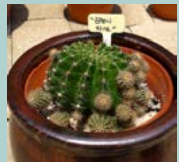
More than a dozen "pups" growing on a "Ben Hur" hybrid.