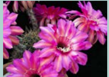
K-T Hybrid Echinopsis with incredible flowers!