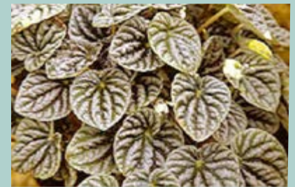
Peperomia caperata variegata