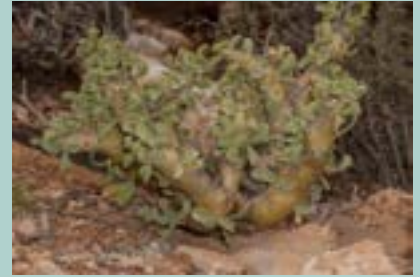
Pelargonium klinghardtense in habitat