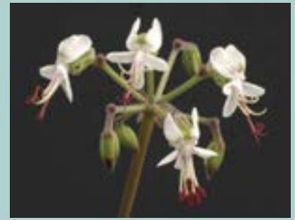
Flowers of Pelargonium laxum

Pelargoniums are mostly winter growing succulents that are well suited for our wet-winter, dry-summer climate in California. Although they are winter growers, they should be protected from frost. And the good news is that most of these species are very easy to grow, if attention is paid to providing an environment very similar to their South African home. Some species, such as P. echinatum and P. triste are tolerant enough to be naturalized in the ground in warmer California climates when given good drainage and protected from summer watering. Many species will not go dormant if watered all summer, but the plant health and appearance both suffer. Like most cacti and succulents, when in doubt don't water!