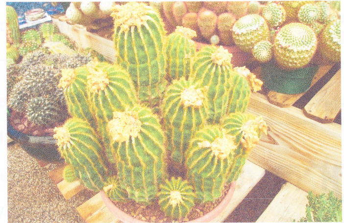
Common but always nice Parodia magnifica

Parodia are native to South America occurring in Argentina, Brazil, Bolivia, Paraguay and Uruguay. Culture is typical of most cacti with the usual requirements of free draining soil, letting the plant dry out between waterings and plenty of sun. Like many Cactaceae Parodia may become sunbunt if grown in unrelenting full sun and do prefer some shade during the day, especially when grown in pots.